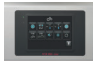
Very user-friendly basic, service and control programs

1. User-friendly: the touch display and intuitive menu navigation make working with the VITA V60 i-Line very easy. The minimalist design and robust technology focus on one central function: reliable firing.