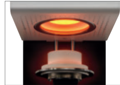
Excellent firing results