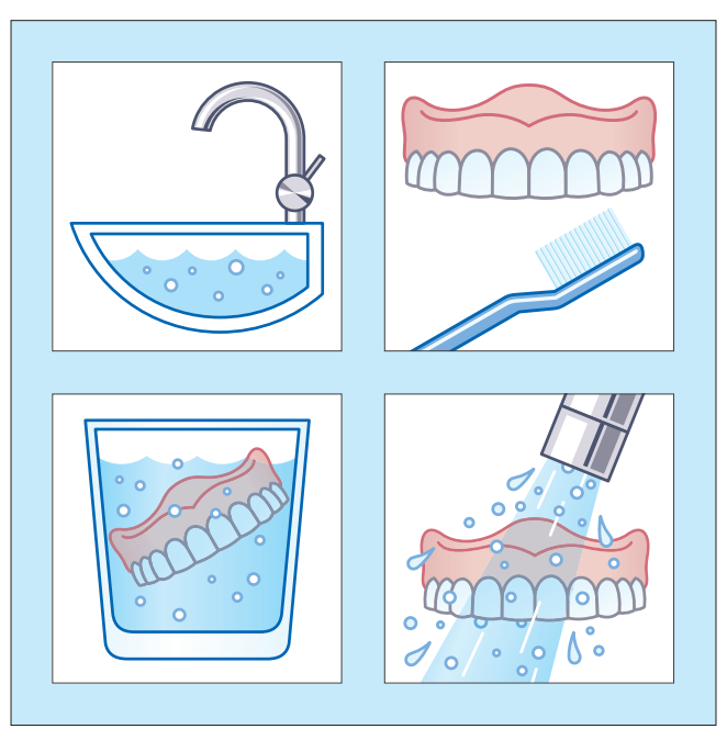
Date of issue 2021-08