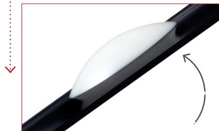
2. Testing of stability by tilting the plate