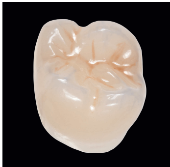
Stained VITA ENAMIC crown prior to wear test