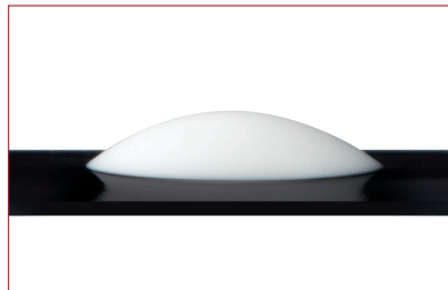
1. Application of the stain on a glass plate

The photographs show VITA AKZENT LC EFFECT STAINS white on the glass plate after the application and after 60 seconds in the tilted position.