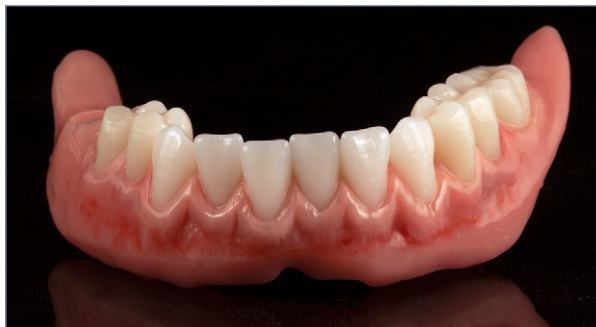
The slight overlap in the lower anterior area provided an individual appearance.