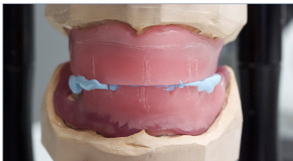
The master models were articulated using jaw relation determination.