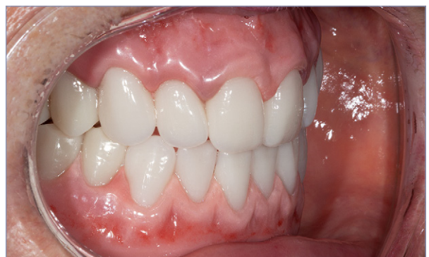
Denture teeth and mucogingival reproduction formed a natural-looking restoration.