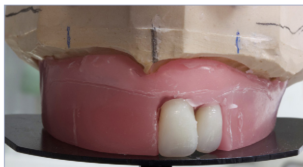
Tooth 22 was slightly inclined in the palatal direction to facilitate an individual appearance.