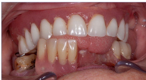
The patient's insufficient dentures needed to be restored.

appearance that offered her peace of mind with a secure grip when chewing and speaking. After detailed consultation, she decided to have a new full denture made. For this purpose, the VITAPAN EXCELL denture tooth was selected in the appropriate tooth shape to ensure a natural appearance and setup in accordance with esthetic guidelines. In the posterior area, VITAPAN LINGOFORM was used. As an initial basis for the work to be completed, anatomical situation impressions were taken with alginate in order to create custom trays in the laboratory. These were used in a second session to take mucodynamic impressions. The first impression was taken using Heavy Body, and the second, fine impression using Light Body A-silicone. Once the master model had been fabricated, this was used as a basis for fabricating bite registrations with wax rims for determining jaw relation. The spatial arrangement of the jaws in relation to one another could be transferred to the articulator using the intraorally encoded registration data. Following analysis of the model, the appropriate wax setup for the patient was started.