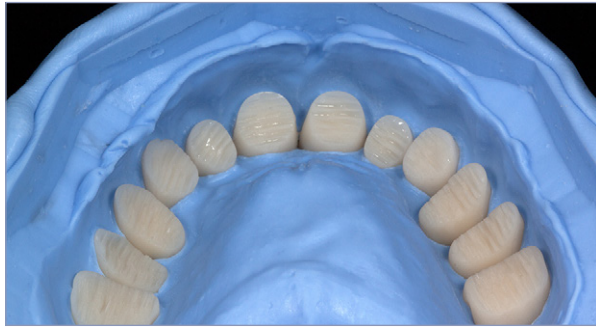
The cleaned and conditioned denture teeth repositioned in the silicone key.

A silicone key was fabricated from the wax setups; the teeth were removed, cleaned and conditioned in the base and cervical areas for acrylic fabrication. Following repositioning of the denture teeth in the silicone key and prior to pouring, the complete denture base was customized with Castdon polymer, and the vestibular labial shield and palate area customized using shades from the Denture Art system (both products from Dreve Dentamid, Unna, Germany). Following repositioning of the master model in the key and autopolymerization,