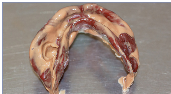
Two-phase mucodynamic impressions were taken of the upper and lower jaw.