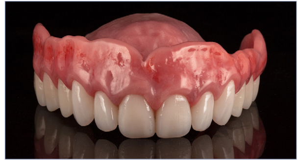
The completed, finished upper denture had a completely natural appearance.

both dentures were finished using a rotating instrument. Final polishing was carried out using a pumice stone, polishing paste and a polishing wheel. Depending on the age of the patient, the age of the teeth can be controlled by reducing the surface texture to a greater or lesser degree by quickly polishing. In this case, the surface texture of the teeth were consistently avoided by using a handpiece in order to maintain a more youthful appearance for the denture teeth.