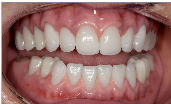
Both dentures could be integrated harmoniously in the oral cavity.