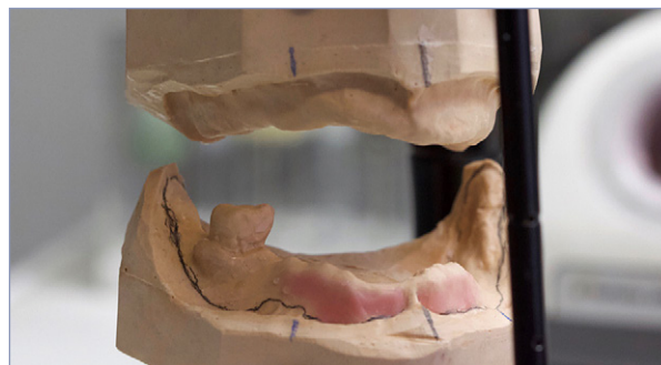
After model analysis, it was possible to begin setup.