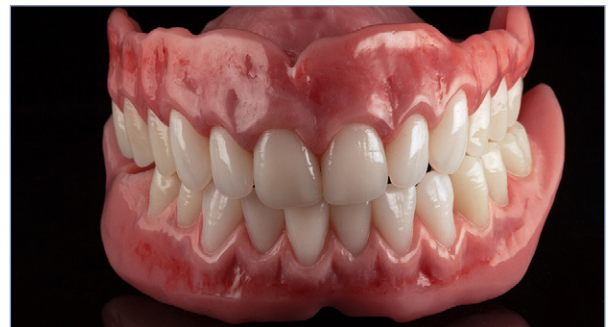
The highly esthetic full denture restoration prior to insertion.