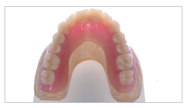
... and VITA PHYSIODENS Posterior.