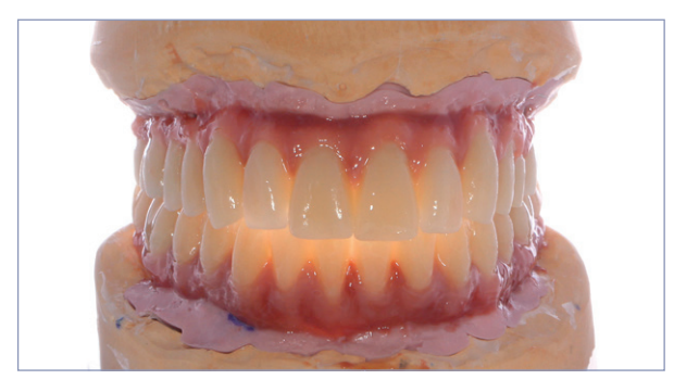
In the vestibular region, the mucogingival areas were individualized using VITA VM LC {\it flow} veneering composite.