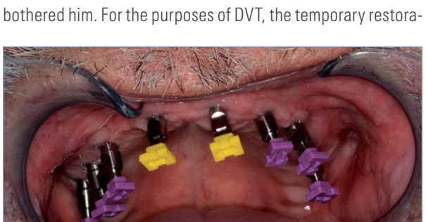
Analogs were screwed on to the healed implants and impression caps positioned on the analogs.

A 68-year-old male patient had been provided with temporary dentures. After a year had passed, he wanted a fixed, light and palateless implant-retained restoration. The two temporary dentures could be used as the basis for the new implant-retained dentures, as the patient was able to function properly with them. Only the functional margins and the covered palate bothered him. For the purposes of DVT, the temporary restora-