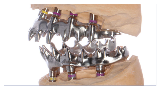
The substructures (before clinical try-in) were seated without tension on the master models.