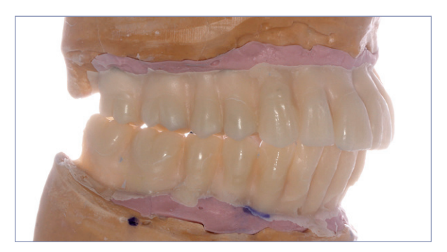
It was possible to then finish the polymerized base.