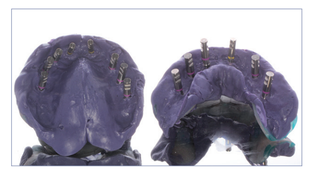
The fixation impressions were taken in the upper and lower jaw with a closed tray.

tions were modified to act as X-ray templates. During backward planning using this 3D diagnostic tool, it was possible to position the implants virtually in the bone and create a drill template on this basis. Once the implants had been inserted and healing was complete, fixation impressions were taken and master models fabricated that were articulated appropriately for the patient using the registered temporary dentures.