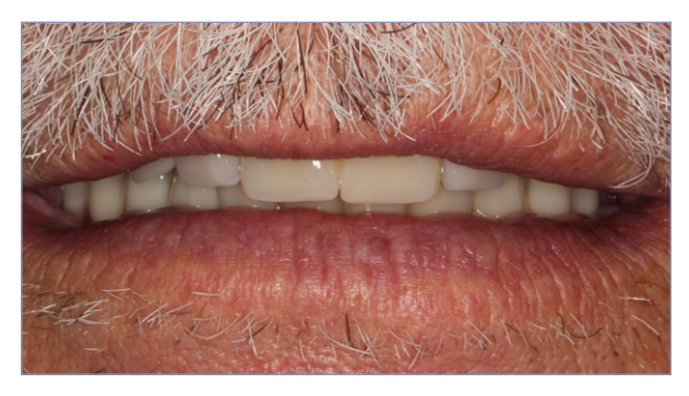
In the occlusal rest position, an optimum interplay was also visible between the lip line and incisal edges.

smile. Despite adaptation to the substructures, the denture teeth retained full shade fidelity. The chemically and shade-coordinated material mix of prefabricated teeth, cold-curing polymer and veneering composite was controlled during manual fabrication, which led to a highly esthetic result.