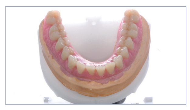
The wax setup was achieved using VITAPAN EXCELL Anterior ...

selected in A2 in order to quickly achieve unique centric occlusion. The patient wanted custom anterior positioning instead of straight positioning. Final verification of occlusion, phonetics and esthetics could then be performed during clinical try-in.