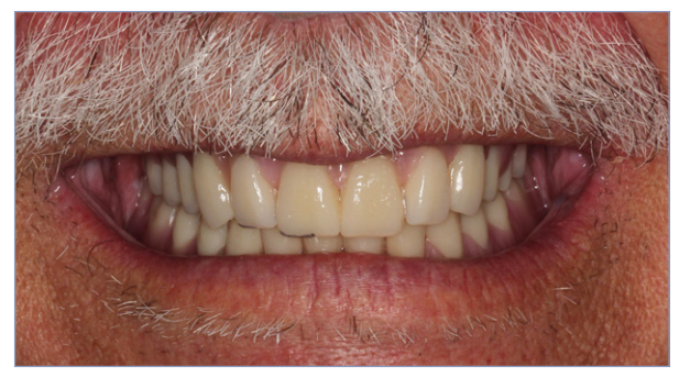
The incisal excess at 12 and 22 was marked so that corresponding changes could be made.