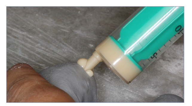
The tooth-colored VITACOLL CC cold-curing polymer resin was injected into the silicone matrix via a posterior access.

between the homogeneously shaped cold-curing polymer resin and the denture teeth. Once finishing had been completed, the gingival appearance of the patient was replicated in the vestibular area using the flowable light-curing veneering composite VITA VM LC flow. Finishing was performed using a fine diamond instrument and fine pumice, followed by diamond polishing paste.