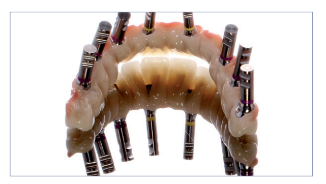
The finalized restoration with screwed-on implant analogs was very light.