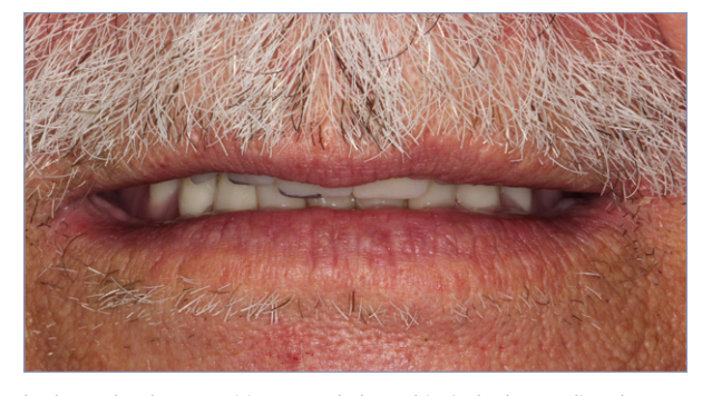
In the occlusal rest position, an unbalanced incisal edge gradient became obvious.