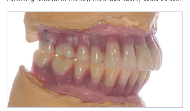
Using a silicone key, the setup was transferred to the substructures and the base modeled in full using wax.

Following wax extraction, cleaning and conditioning, the denture teeth were fixed in the duplicating key using superglue, and VITACOLL bonding agent was applied in the basal-cervical area. The silicone matrix was then repositioned on the master model. It was then possible to inject the tooth-colored cold-curing polymer resin VITA VM CC A2 via a posterior opening. Following removal of the key, the shade fidelity could be seen