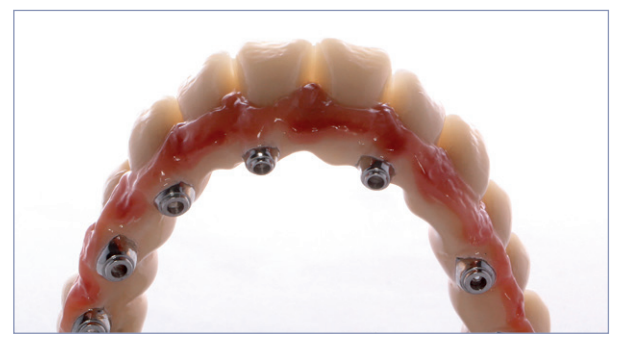
The natural morphology and surface texture of the upper incisors in reflected light.