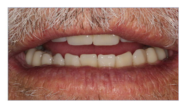
Finally, when opened slightly, it was possible to see a harmonious incisal edge gradient.

Since the patient was already familiar with the setup, he immediately felt comfortable with his new appearance. The correct teeth had been chosen from among the wide range of shades and moulds available with VITAPAN EXCELL, making it possible to restore the patient's age-appropriate and natural