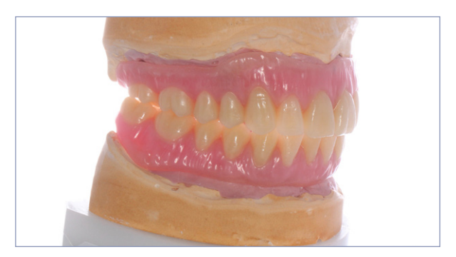
In the posterior area, VITA PHYSIODENS enabled efficient setup.