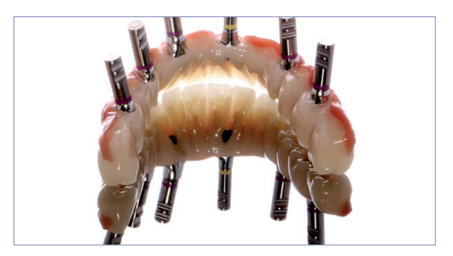
The slight basal supporting surface ensures effective cleaning around the implants.