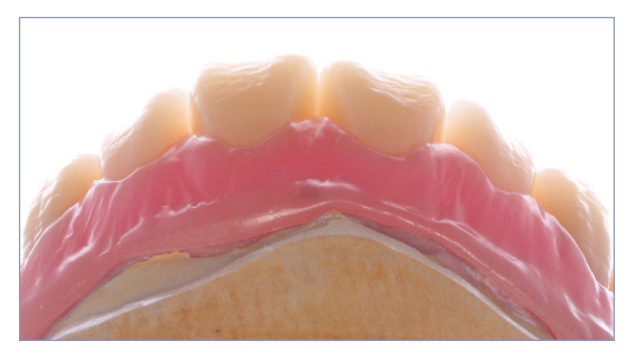
The nested VITAPAN EXCELL setup reflects its natural surface texture and morphology.