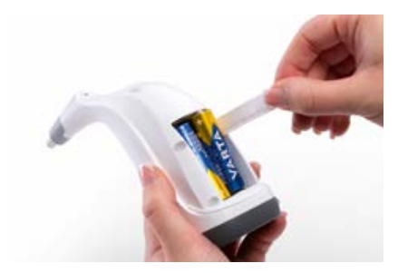
Figure 3 - Changing batteries: Remove battery on right