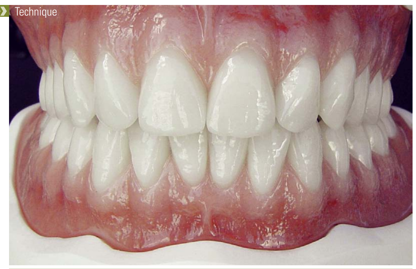
Complete upper and lower denture with individual gingiva