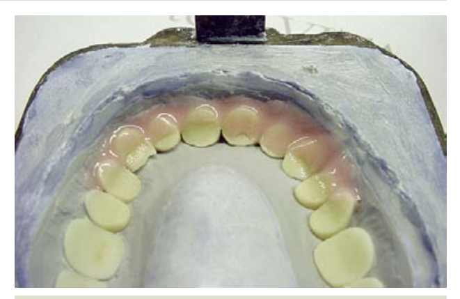
Fig. 19: After a short swelling time, the cervical area is covered by approx. 3 mm