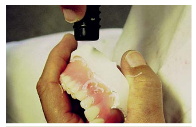
Fig. 10: Wax flakes are blown off with compressed air