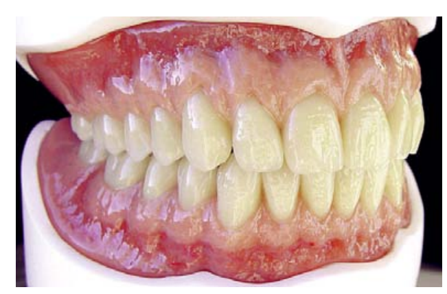
Fig. 4: Lifelike design of the artificial gingiva