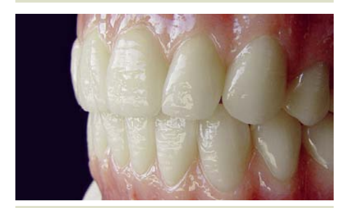
Fig. 13: ... once modelled in dental acrylic, should no longer be processed with cutters in this area

Two things are essential here: firstly, the interdental spaces must be modeled precisely, and secondly, no wax residue must remain on the tooth surface.