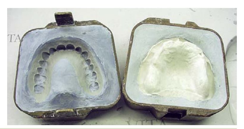
Figs. 14 and 15: The modellation is invested in a conventional pressing flask