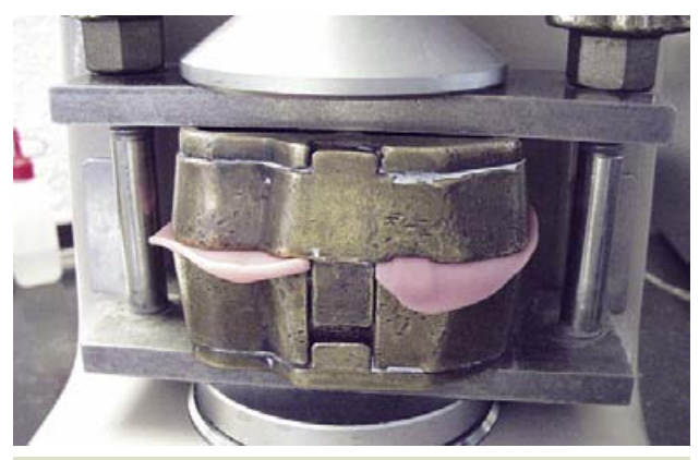
Fig. 23: ... the rest of the denture base is packed

Teeth that are modeled on nature, and an individual gingival design closely resembling that of natural gingiva in its modellation and shading give the prosthesis a "real" and harmonious appearance (fig. 26). The result is what counts, no matter which materials are actually used and processed. Anyone who has already tried to copy natural gingiva will know that it can vary greatly in its contour and shading. Our goal should be to keep on getting closer and closer to nature. The technique presented here was developed and perfected in such a way that it can be easily integrated into the everyday procedures of the laboratory. To this purpose, it is important to keep the expenditure of time and equipment at a reasonable level. Our patients appreciate us for this, and are also prepared to recompense us for the extra work that this entails.