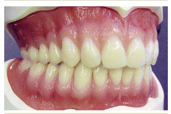
Fig. 26: VITA PHYSIODENS with individual gingival design