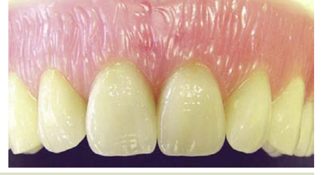
Figs. 8 and 9: The gingival margin is positioned in the lower third of the tooth

To achieve a natural appearance of the artificial gingiva, and display every tooth to its best advantage three-dimensionally with spatial depth when designing the artificial gingiva, the PHYSIODENS anterior by VITA Zahnfabrik is unequalled. The painstaking, time-consuming correction procedures required with customary anterior teeth are no longer necessary with PHYSIODENS.