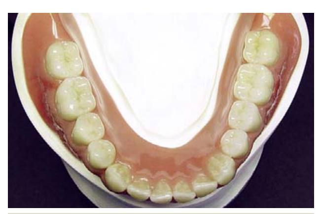
Fig. 2: The posteriors are set up according to nature's occlusal surface relief...