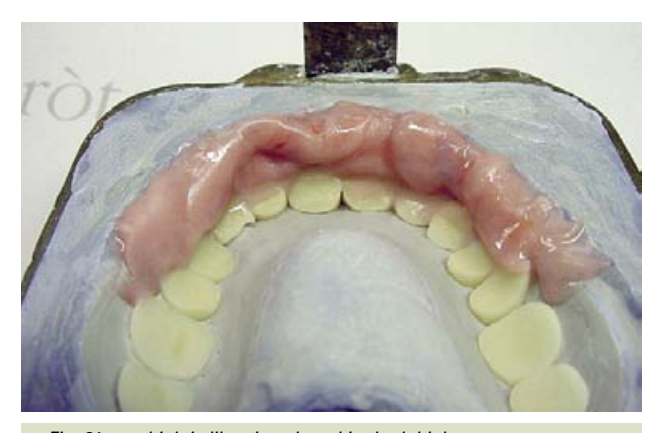
Fig. 21: ... which is likewise placed in the labial area