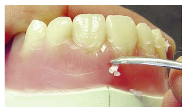
Fig. 7: The wax is formed using a suitable instrument