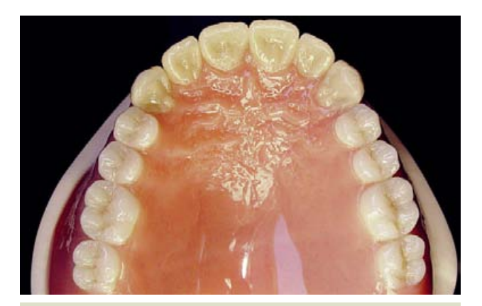
Fig. 3: ... and according to the functional principles of natural