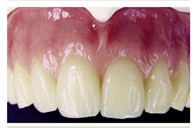
Fig. 25: After polishing