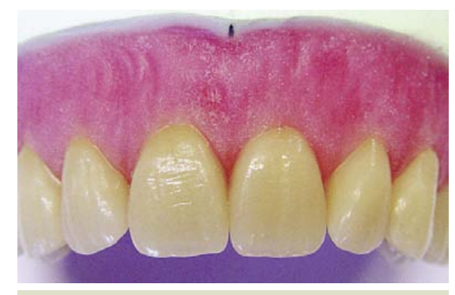
Fig. 11: The modellation before processing with a spirit burner...