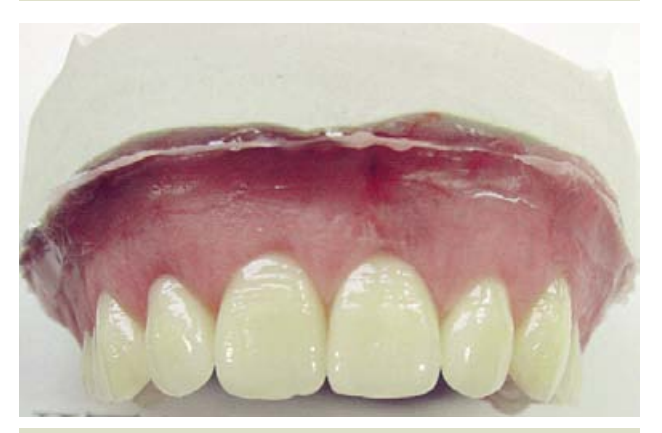
Fig. 24: The maxillary prosthesis immediately after deflasking