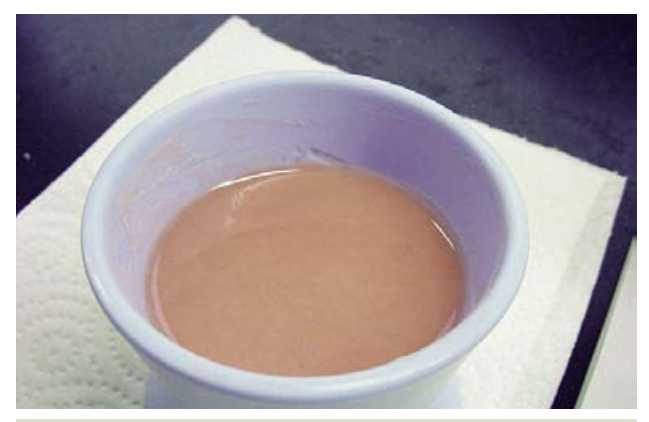
Fig. 22: After mixing the basic shade 34 and leaving it to swell