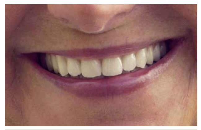
Fig. 1: Patient oriented – a natural and likeable appearance