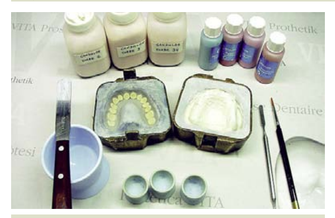
Fig. 18: Once the insulation is dry, packing can begin