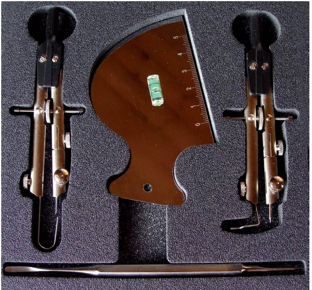
EXCLUSIV-MEASURING -SET by VIKTOR FÜRGT