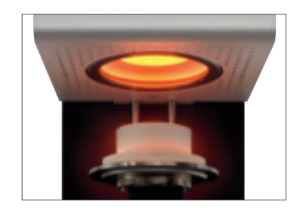
Excellent firing results