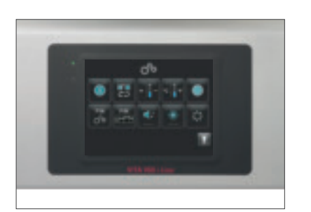
Very user-friendly basic, service and control programs