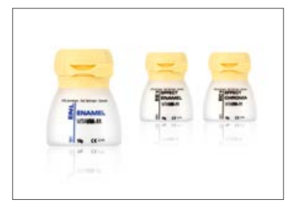
Fig. 1 VITA VM 11 effect materials