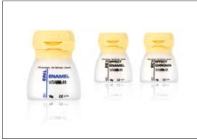
Fig. 1 VITA VM 11 effect materials