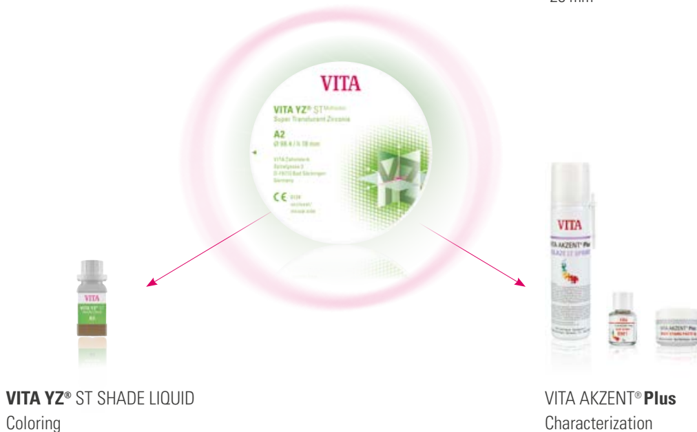
VITA YZ® ST SHADE LIQUID Coloring