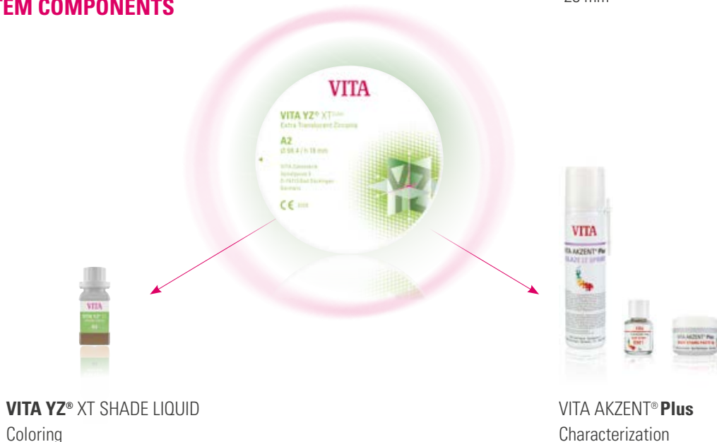
VITA YZ® XT SHADE LIQUID Coloring