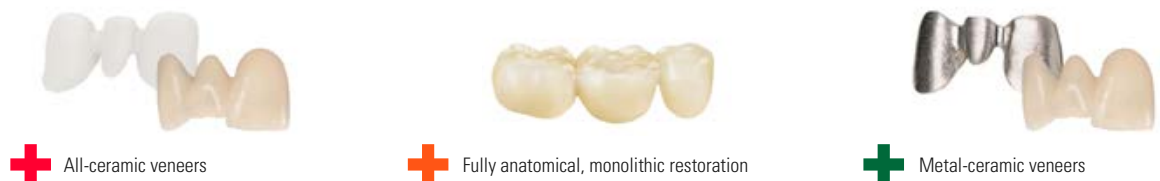
+ All-ceramic veneers